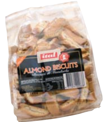
Ital Almond Biscotti 400gm