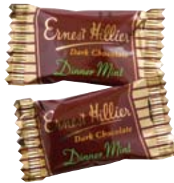
Ernest Hillier Dinner Mints 6g