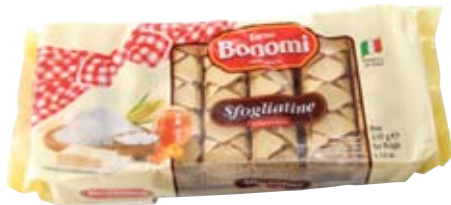
Sfoagliatine Glazed 135gm