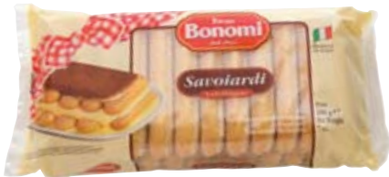
Savoiardi Vanilla 200gm