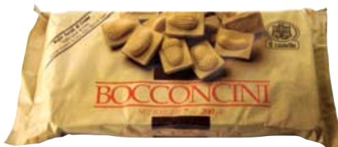
Il Castello FruFru 150gm Chocolate Wafers Bocconcini 200gm Wafers filled with Cream