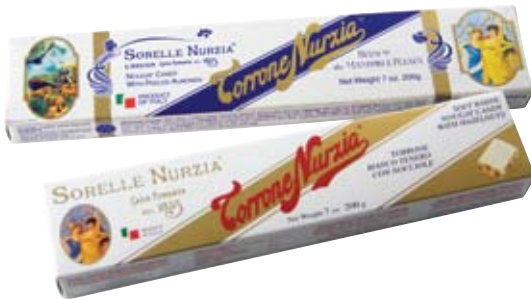
Gianduja Milk Chocolate w Hazelnuts Hard White Nougat Chocolate Coated Nougat w Peeled Almonds