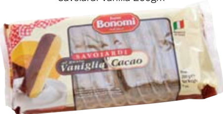
Savoiardi Duo Vanilla & Chocolate 200gm